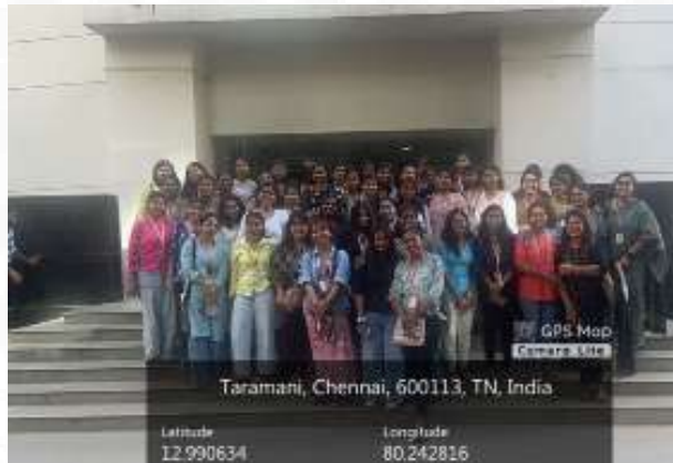
I M.A. Communication students at the IITM Research Park (2024-2025)