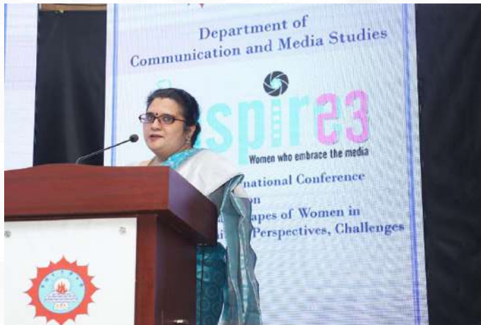
Inspire 2023 - Inauguration Session