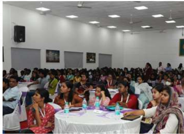
Inspire 2023 - Delegates