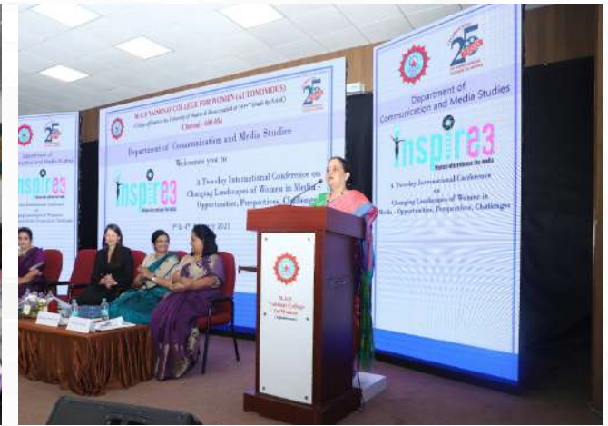
Inspire 2023 - Changing Landscapes of Women in Media