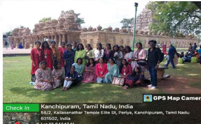
I M.A. Communication students at Kanchipuram - Photography Trip (2024-2025)