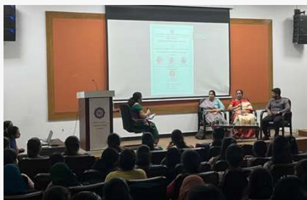
National Nutrition Month Celebration Panel Discussion, 2025