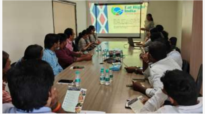
Awareness program on importance of healthy lifestyle to corporate employees