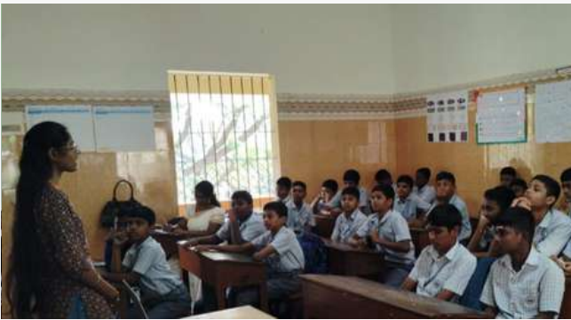
Nutrition Education program to school students