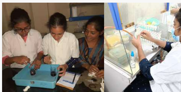
Industrial Visit Cum Workshop, 2025