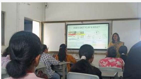
Guest Lecture on Sustainability, 2025