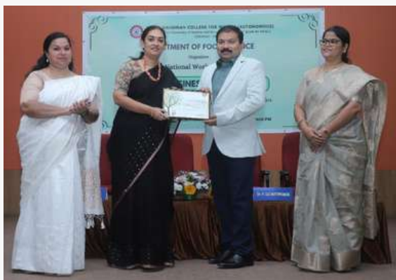
Food Business Initiative 2.0, 2025