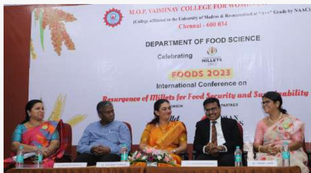
FOODS-International Conference on Resurgence of Millets, 2023