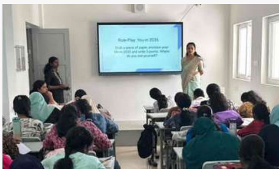
Freshers' Orientation Session, 2025