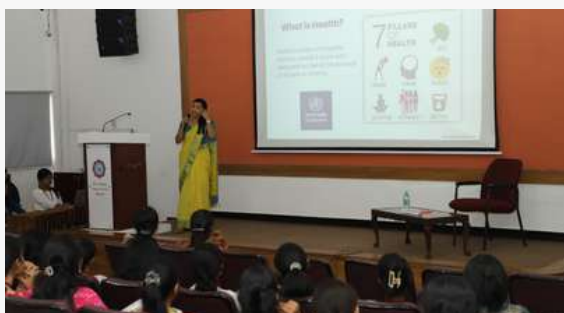
Breastfeeding Week Celebration, 2023