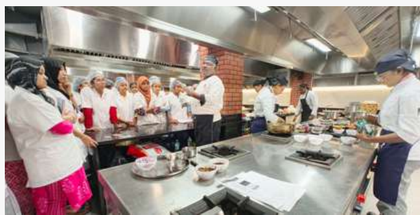
Workshop on Recipe Formulation and Standardization, 2026