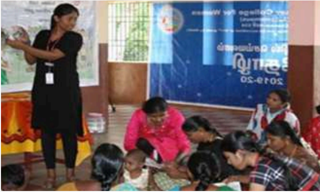
Thozhil Seyyalam Thozhi

The department is committed to instilling a sense of social responsibility in its students. They engage in various outreach and community development programs that benefit school children, corporate employees, and women in self-help groups.