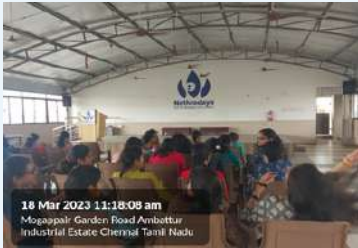
At Nethrodaya Blind school, Chennai

The B.Com Honours Programme has always instilled a sound value system in its students through meaningful contributions to society with compassion. The students have made significant contribution in terms of their time and resources to social causes.