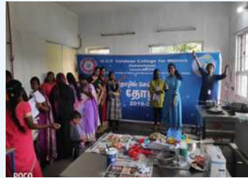
Skill Training to women in rural areas, Ponneri