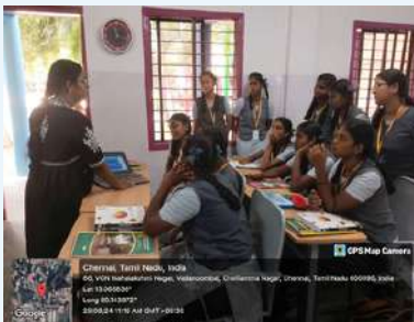
At Sri Saraswathi Vidhya Mandir Matriculation School, Chennai