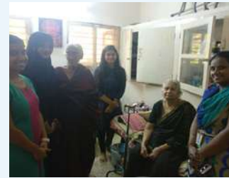
Service to Elders at Old Age Home, Chennai