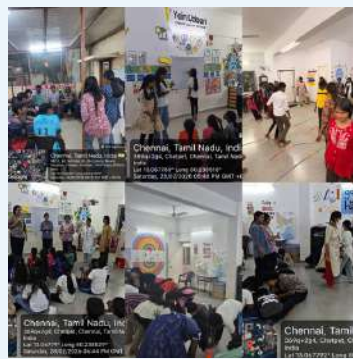
At Yein Udaan, a Chennai-based NGO