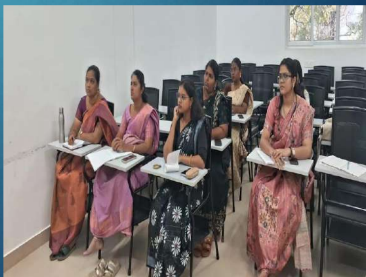
Students engaged in UGC NET Paper 1 coaching - nurturing future educators and researchers.