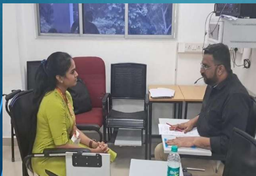
Shaping futures through successful placements and career opportunities.