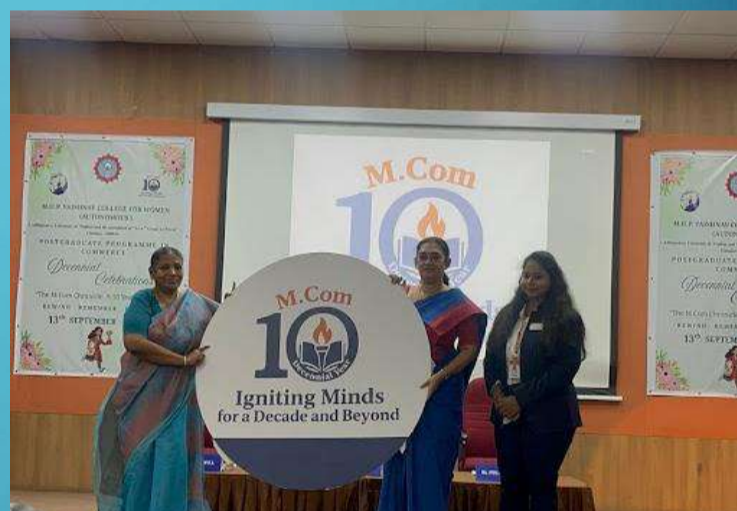
Unveiling the Decennial Logo: A Symbol of Ten Years of Academic Excellence