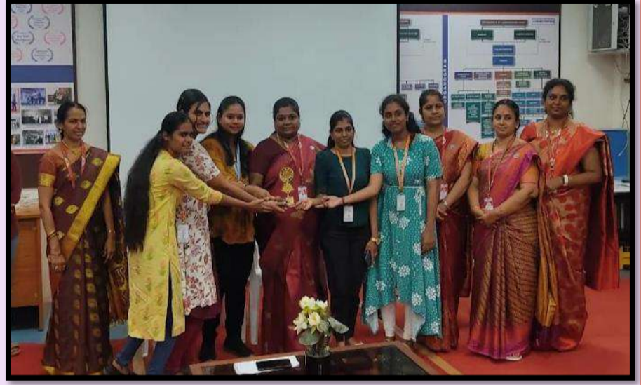
Students of 1 st and 2 nd M.Com Won the Overall Trophy in Dhruva 2026 conducted by SSS Jain College for Women