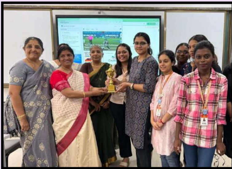
Students of 1 st and 2 nd M.Com Won the First Place in Food with Thought – Sep 2025 and Jan 2026.