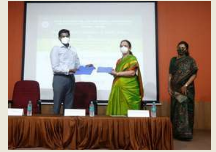
MoU signed between Tamil Nadu e-Governance Agency and M. A. Public Policy