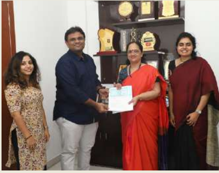
MoU signed between Apogee Research Forum and M. A Public Policy