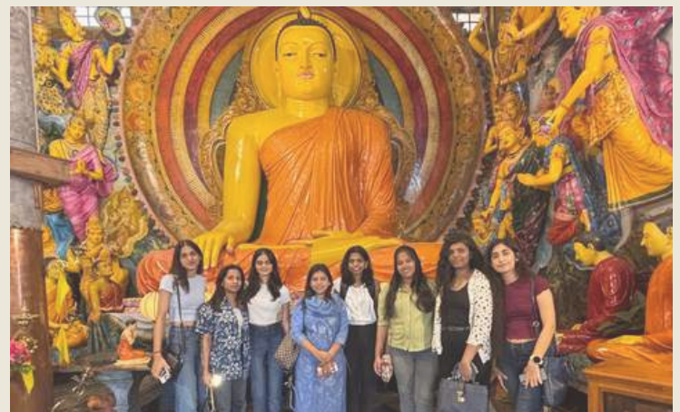
International Paper presentations, Jaffna Law University, Sri Lanka