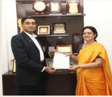
MoU signed between Surana & Surana International Attorneys and M. A Public Policy