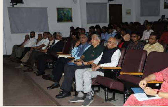
3rd Annual National Seminar- "Asia Security Dilemma"