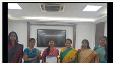
Certificate course on “Brief Psychotherapies”

Community Mental Health - M.S.Chellamuthu Trust & Research Foundation