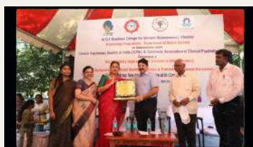
Honorable MP Thiru. Dayanidhi Maran at the inauguration of WMHD '24