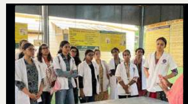
Field Visit to Trishul De-addiction Centre, Madurai