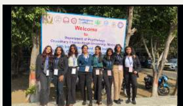
Students at the Psychological Science Congress Conference at Chaudhary Charan Singh University, Meerut, U.P for paper presentation