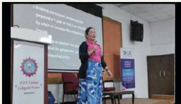
Seminar on "Cognitive Neuroimaging and Data Science" in collaboration with Si- UK