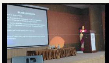
National Symposium on "Brain & Behaviour" in collaboration with CPSI