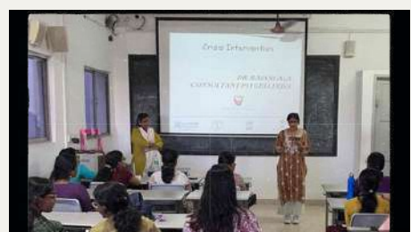
Certificate course on “Psychosocial Rehabilitation”