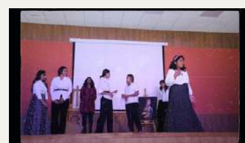
Theatrical production of the play "Taint" by students.