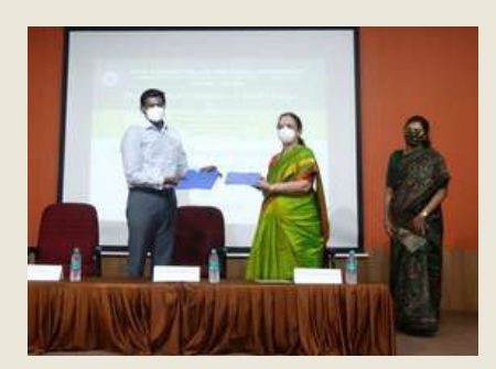
MoU signed between Tamil Nadu e-Governance Agency and M. A. Public Policy