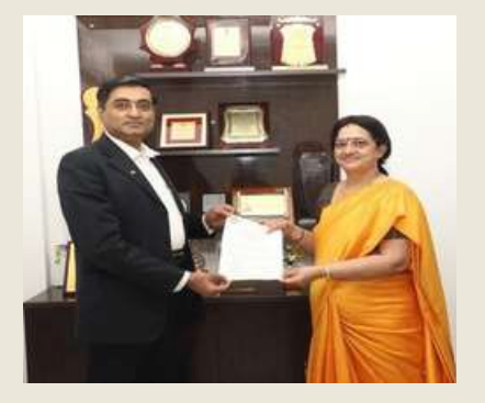
MoU signed between Surana & Surana International Attorneys and M. A Public Policy