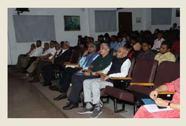
3rd Annual National Seminar- "Asia Security Dilemma"