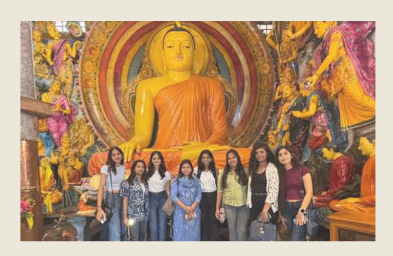
International Paper presentations, Jaffna Law University, Sri Lanka