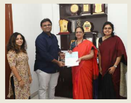
MoU signed between Apogee Research Forum and M. A Public Policy