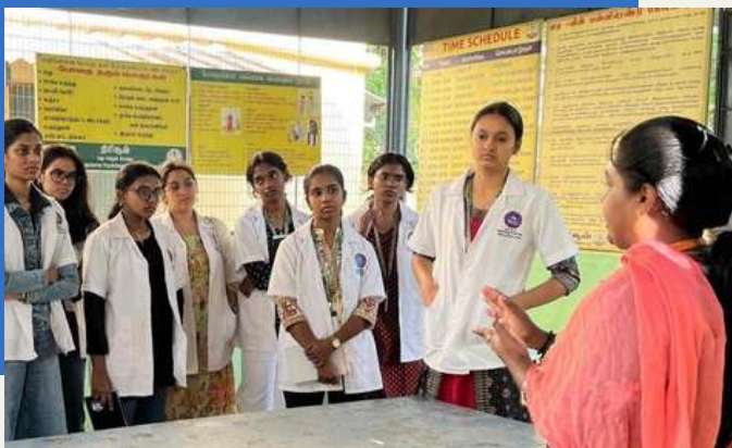
Field Visit to Trishul De-addiction Centre, Madurai