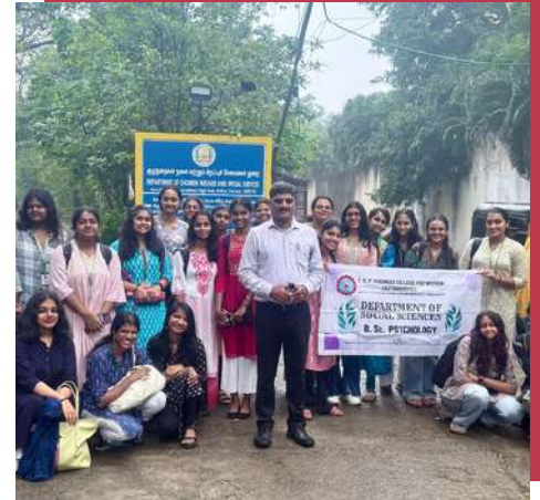
Field Visit to Child Welfare Committee, Kelly's, Chennai