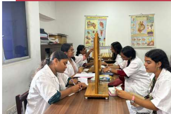
A glimpse at Psychology Laboratory