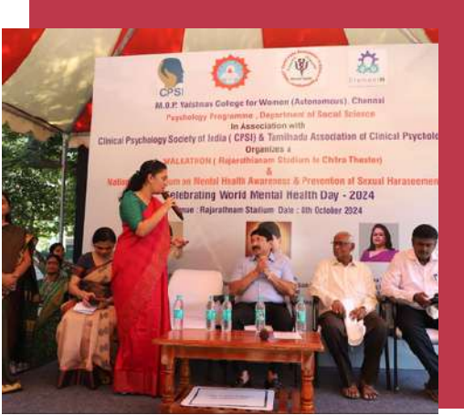
Honorable MP Thiru. Dayanidhi Maran at the inauguration of World Mental Health Day