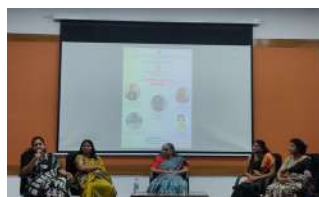
National Nutrition Month Celebration Panel Discussion, 2024