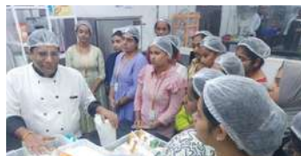
Field Visit to Writer's Cafe, CSIR Road, Taramani