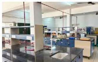
Food Analytical Laboratory