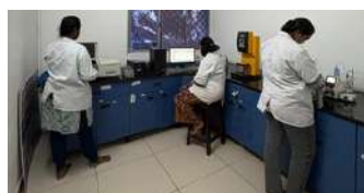
Food Instrumentation Laboratory