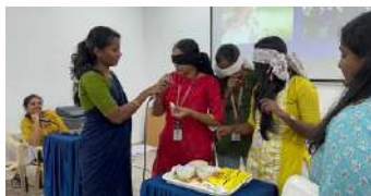
Sensory Analysis Workshop