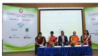
FOODS-ITAF International Conference, 2019