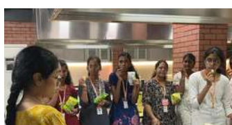
Guest Lecture "From Taste to Texture"