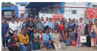
Industrial Visit to Britannia Industries, Chennai