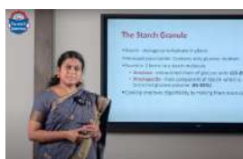
The M.O.P. Classroom E-Content