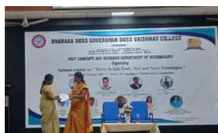
Staff as Resource Person