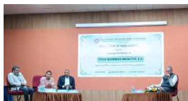
Food Business Initiative 2.0 National Workshop, 2025