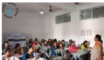
FoStaC Training, 2024