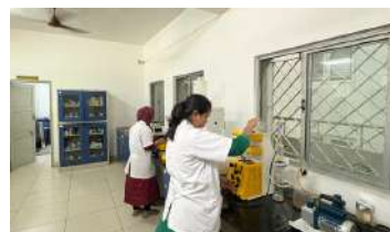
Food Testing Laboratory