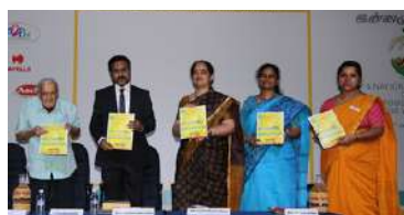
Innamudhu-National Seminar, 2017