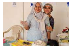
Business on Campus