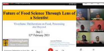
Vivechana-International Conference, 2021