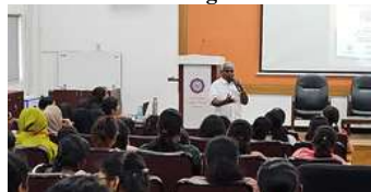
Guest Lecture from Coffee Board India