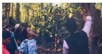
Coffee Plantation Walk, Chikmagalur