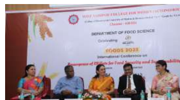
FOODS-International Conference on Resurgence of Millets, 2023