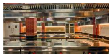
Paakashala Food Innovation Laboratory