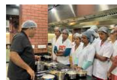
Food Microbiology Laboratory