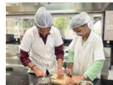
Paakashala - Food Innovation Laboratory