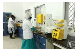
Food Analytical Laboratory