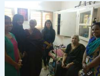
Service to Elders at Old Age Home, Chennai