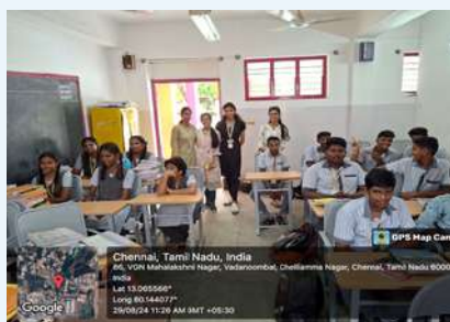
At Sri Saraswathi Vidhya Mandir Matriculation School, Chennai