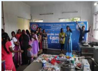
Skill Training to women in rural areas, Ponneri