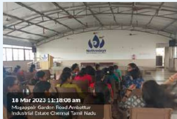
At Nethrodaya Blind school, Chennai

The B.Com Honours Programme has always instilled a sound value system in its students through meaningful contributions to society with compassion. The students have made significant contribution in terms of their time and resources to social causes.