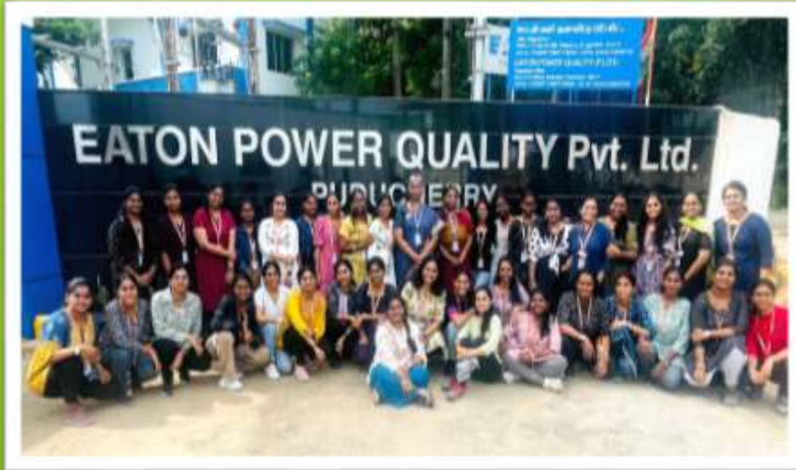
Industrial Visit to Eaton Power Quality Private Limited Pondicherry