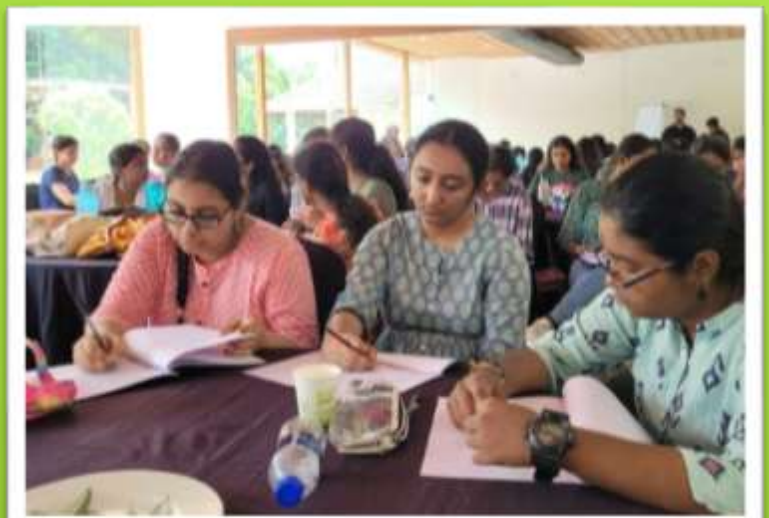
Outbound training to students at Green Meadows Resort, ECR