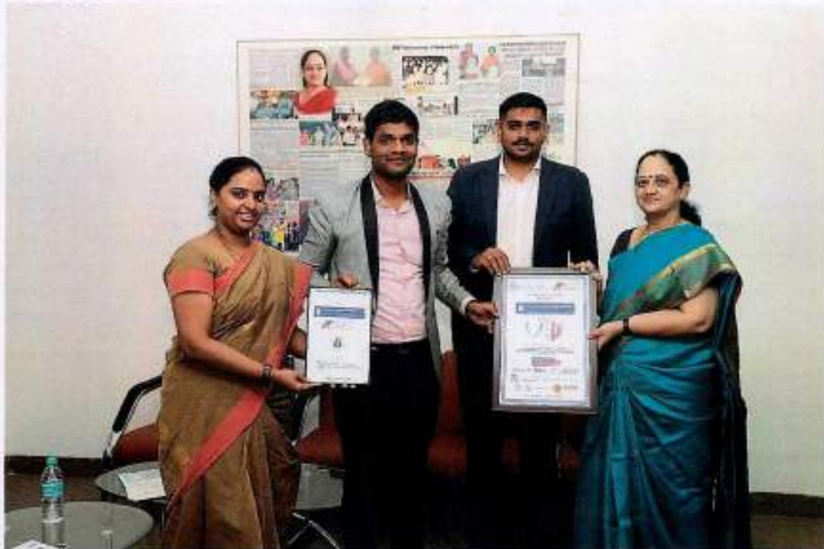
The signing of the MOU with the Royal Commonwealth Society (Asia Region) – Audacious Dreams Groups