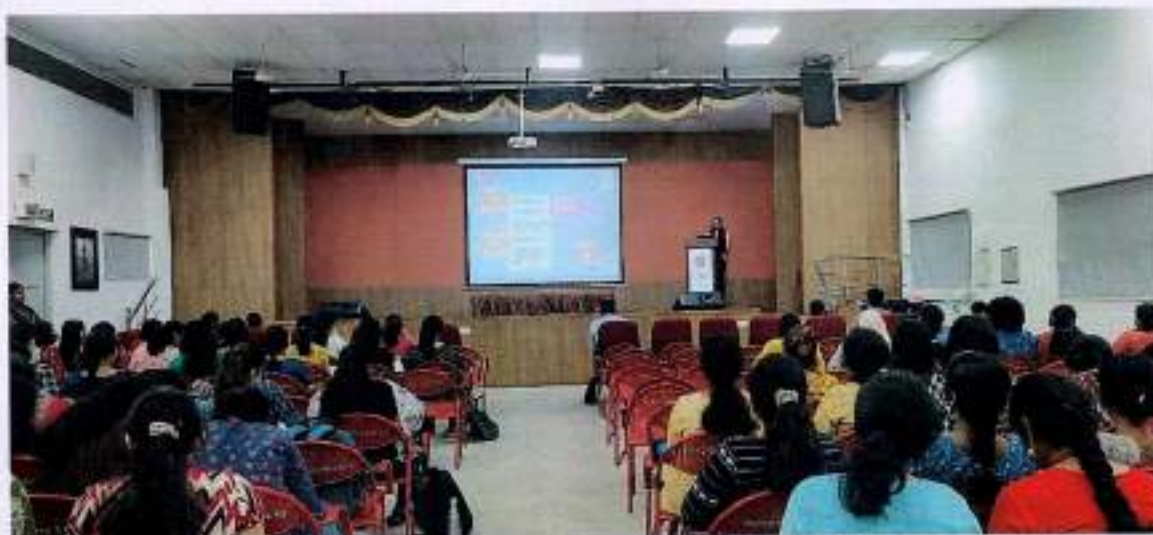
One Day Student Seminar on - Current trends of the Global Employment Market