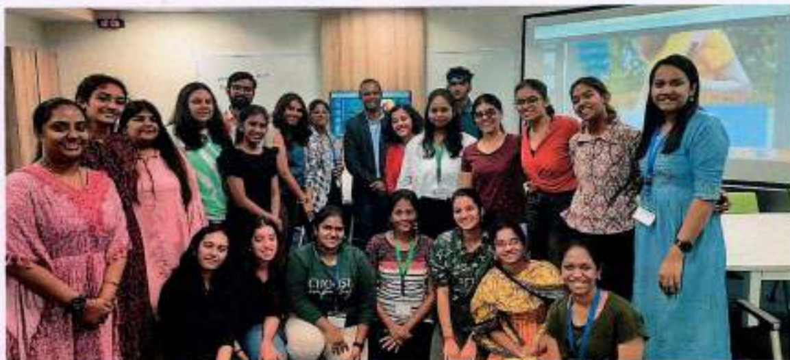
Student Delegation at James Cook University, Singapore

Student Delegation participating in the Youth Exchange Program in Malaysia