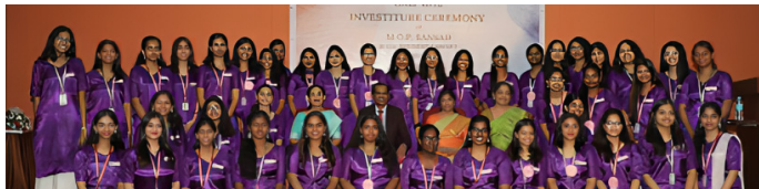
In Frame: M.O.P. SANSAD 2023

M.O.P. kick-starts the academic year with a new student cabinet