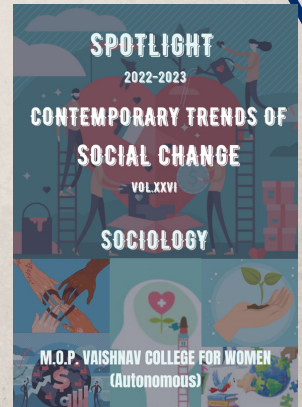
2022- Contemporary Trends of Social Change