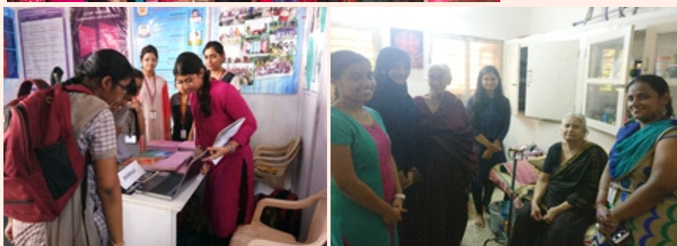
Peer Guidance to Aspiring School Children (L); Service to Elders at Old Age Home (R)