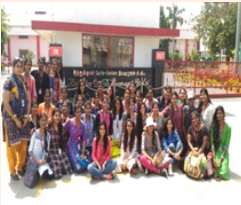
At Coco Cola Factory