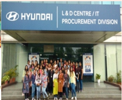
At Hyundai Factory