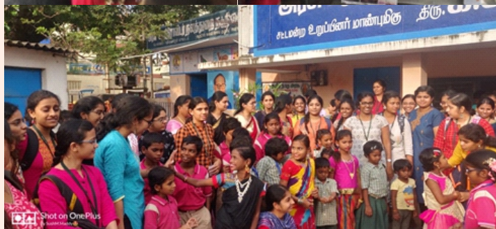
Imparting Education and Interacting with Children at Government School