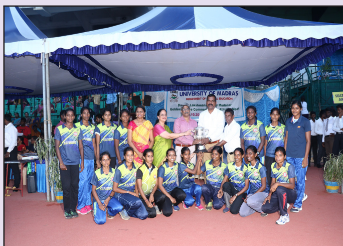
Students of M.O.P Vaishnav being presented with the A.L Mudhaliar Rolling Trophy

This year, the annual college sports day was a two-day extravaganza with departments competing against each other to win the overall trophy.