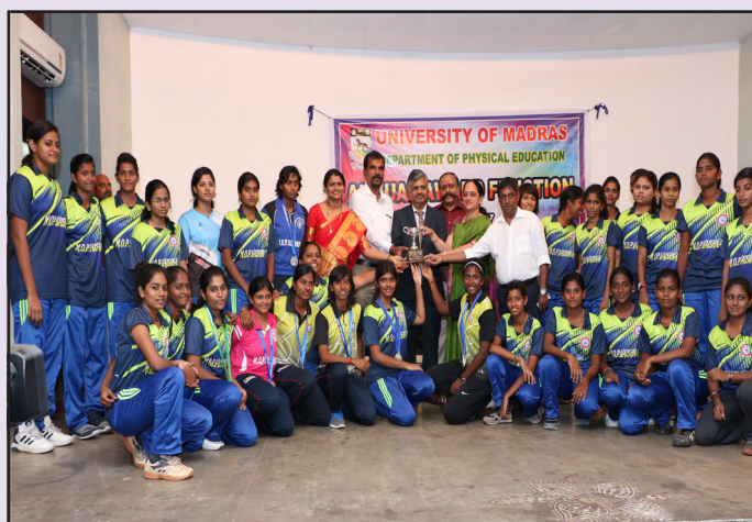
Students of M.O.P Vaishnav being presented with the Dr.Sivanthi Adityan Rolling Trophy