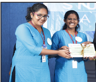
Prize distribution during the valedictory ceremony