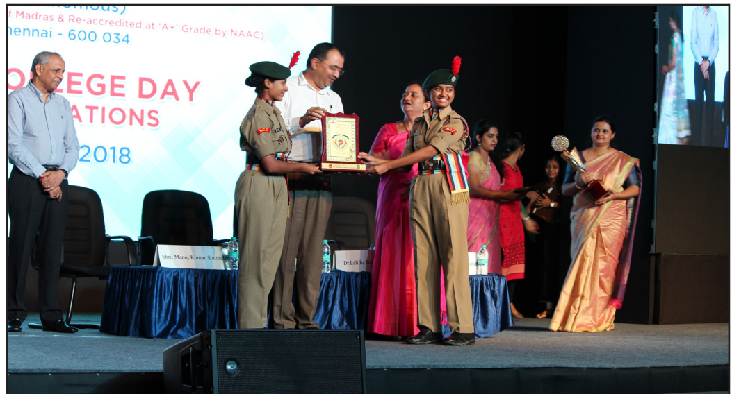
Student achievers were felicitated at the College Day celebrations

He also expressed his appreciation for the diverse programmes and opportunities offered by the college. "I feel like this is the time when one should have been born, taking into consideration the opportunities and technological developments that make learn-