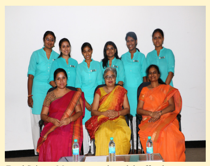
Food Science Management dept club office bearers