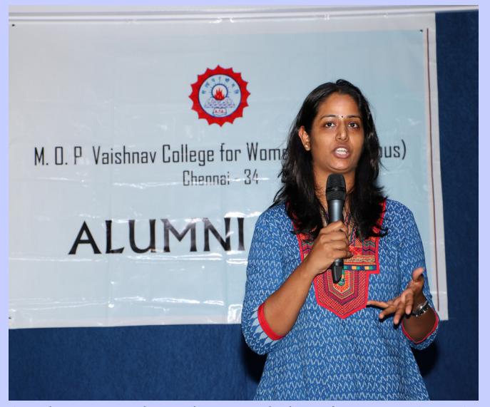
An alumna speaks at the annual alumni meet on Aug. 15