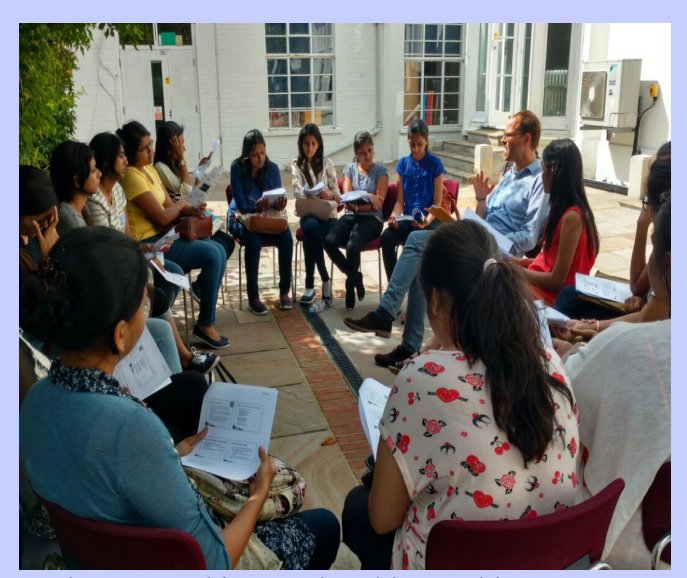
Students attend international internship