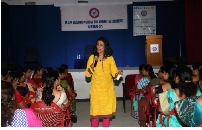
The mothers being briefed about the workings of the club

college, explaining tionale behind the initiative. "It's a three-point triangle, and all have to be in sync.'