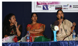
Panel Discussion as a part of Know your rights campaign

The theme focused on social change for both external and internal communities aiming at creating awareness on women rights, health and fitness, cyber security, career perspective and psychological well-being for the internal community and themes like sanitation, child abuse, clean and green Chennai, domestic violence for the external community.