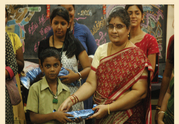
Distribution of notebooks