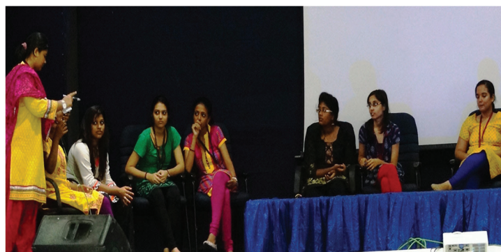
Quiz programme - Yaara Paathu Enna Kelvi Kekare?

On Madras Day, Aug. 22, a "danceversation" titled "Chennayin Gnanaratham," a tribute to the genius poet who lived in the city -- Mahakavi Subramania Bharathi -- was performed. The whole week was one of joy and celebration -- but one emotion was in abundance, and that was love for this beautiful city.