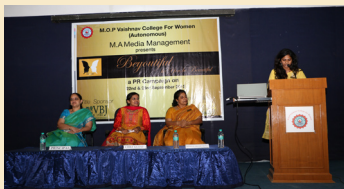
Inauguration ceremony of Beyoutiful campaign

"BEYOUTIFUL - Be You, Be Beautiful." This tagline captures the essential message that the students of I-year M.A. Media Management department aimed to drive home through their public relations campaign held in September. The campaign promoted the importance of