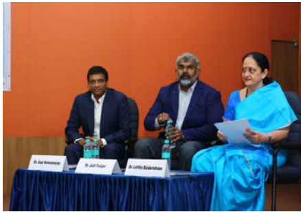
Panelists at the discussion, organised at the Parliamentary Session of the Student Cabinet