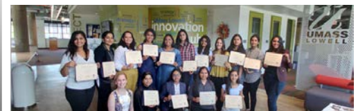
Students at the valedictory ceremony

During the summer of June 2019, 14 students from the School of Business of M.O.P. Vaishnav College For Women, attended a summer course on 'Digital Marketing and International Business' at the Manning School of Business, University of Massachusetts in Lowell. The three-week course covered topics including international business, communication, strategic leadership, search engine optimization, platform business, digital marketing, virtual reality, augmented reality, mixed reality, web design, analytics and customer relationship management. The students were taken on industrial visits to corporate houses in Burlington and Boston.