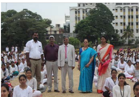
The dignitaries with students