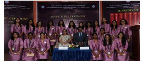
Student Cabinet 2019-2020